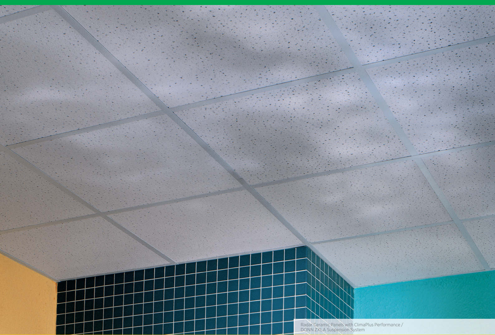
Radar Ceramic Panels with ClimaPlus Performance / DONN ZXLA Suspension System